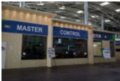
2006 FIFA World Cup™ International Broadcast Centre (IBC), Munich - Outside the HBS Master Control Room (MCR).