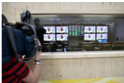
At the IBC Production Centre, HBS produces a broad variety high-quality audiovisual feeds.