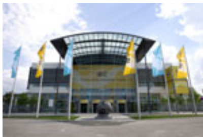
Main Entrance of the International Broadcast Centre (IBC) of the 2006 FIFA World Cup™ at the New Munich Trade Fair Centre.

All visuals are available on CD-ROM for media usage in high-resolution quality. For other visuals, please submit an e-mail request ( press@infrontsports.com OR press@hbs.tv ) or visit www.infrontsports.com .